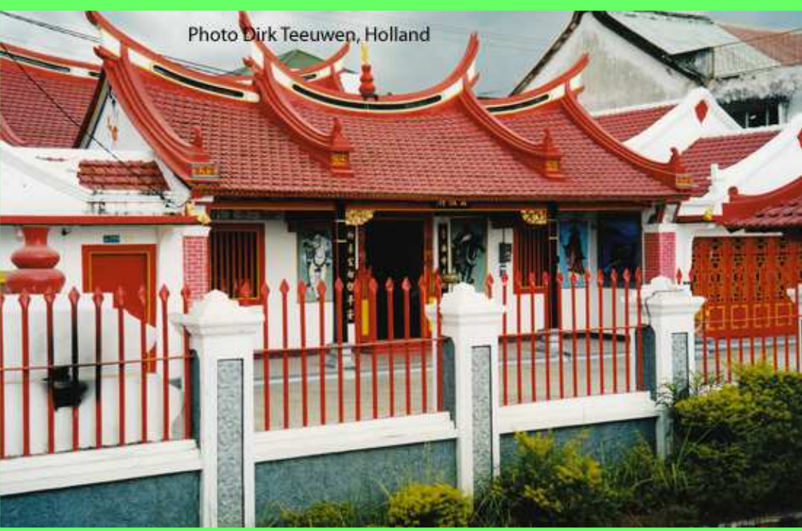
Klenteng (temple) Ling Gwan Kiong, built 1873 Some remains are from the 13<sup>th</sup> century.