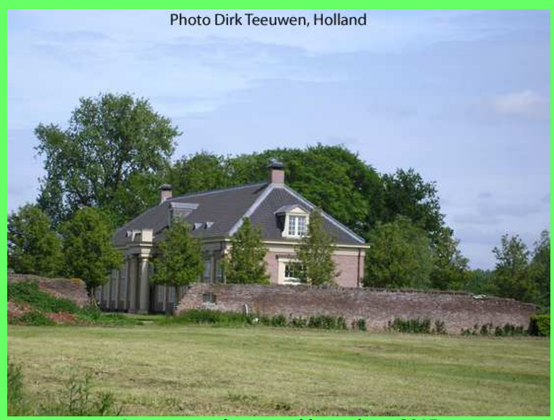
Annex, near the vegetable gardens; 2015