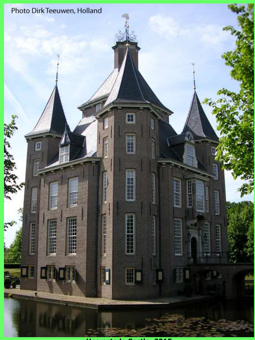
Heemstede Castle, 2015 Main entrance