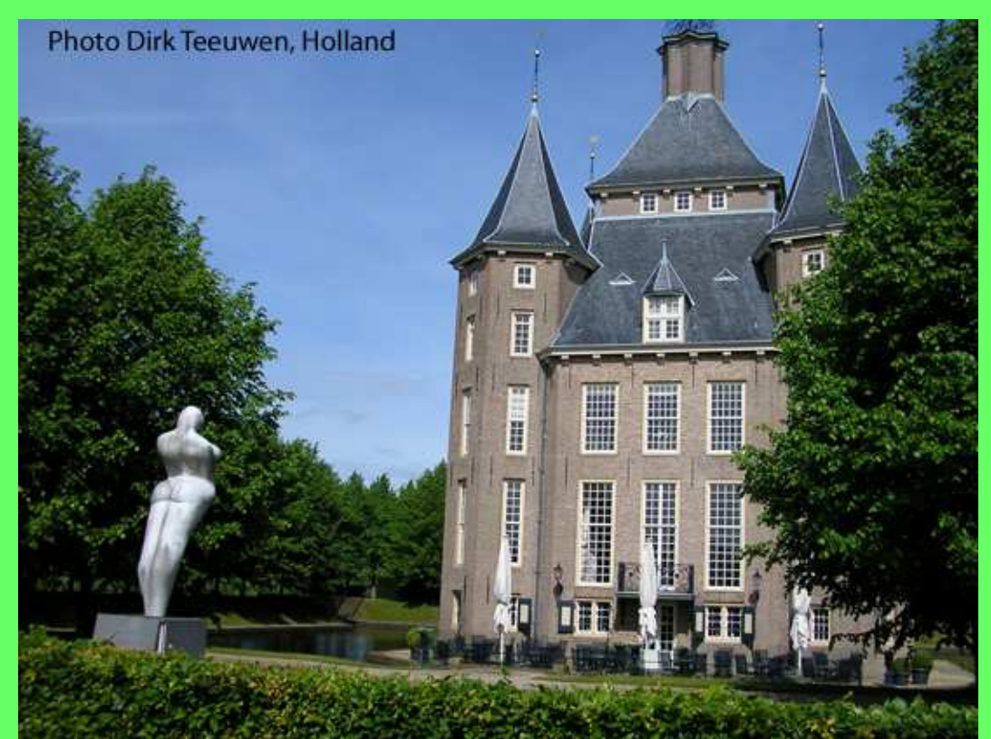
Southern front, 2015