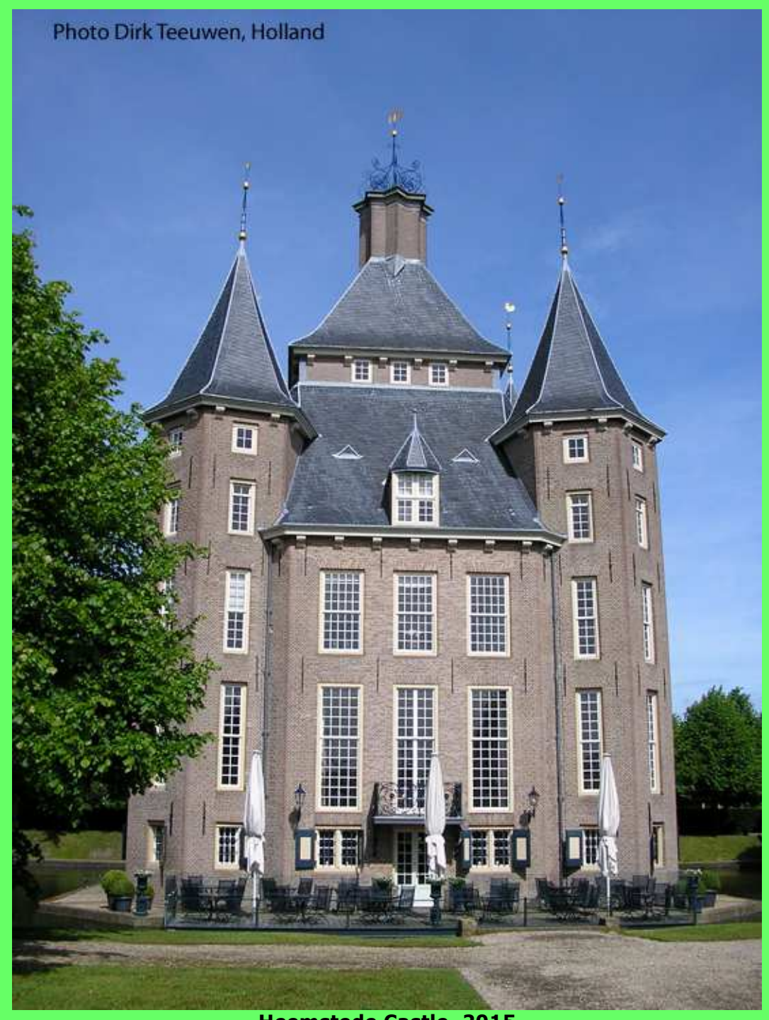
Heemstede Castle, 2015 Southern front