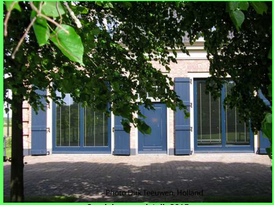
Coach houses, detail; 2015