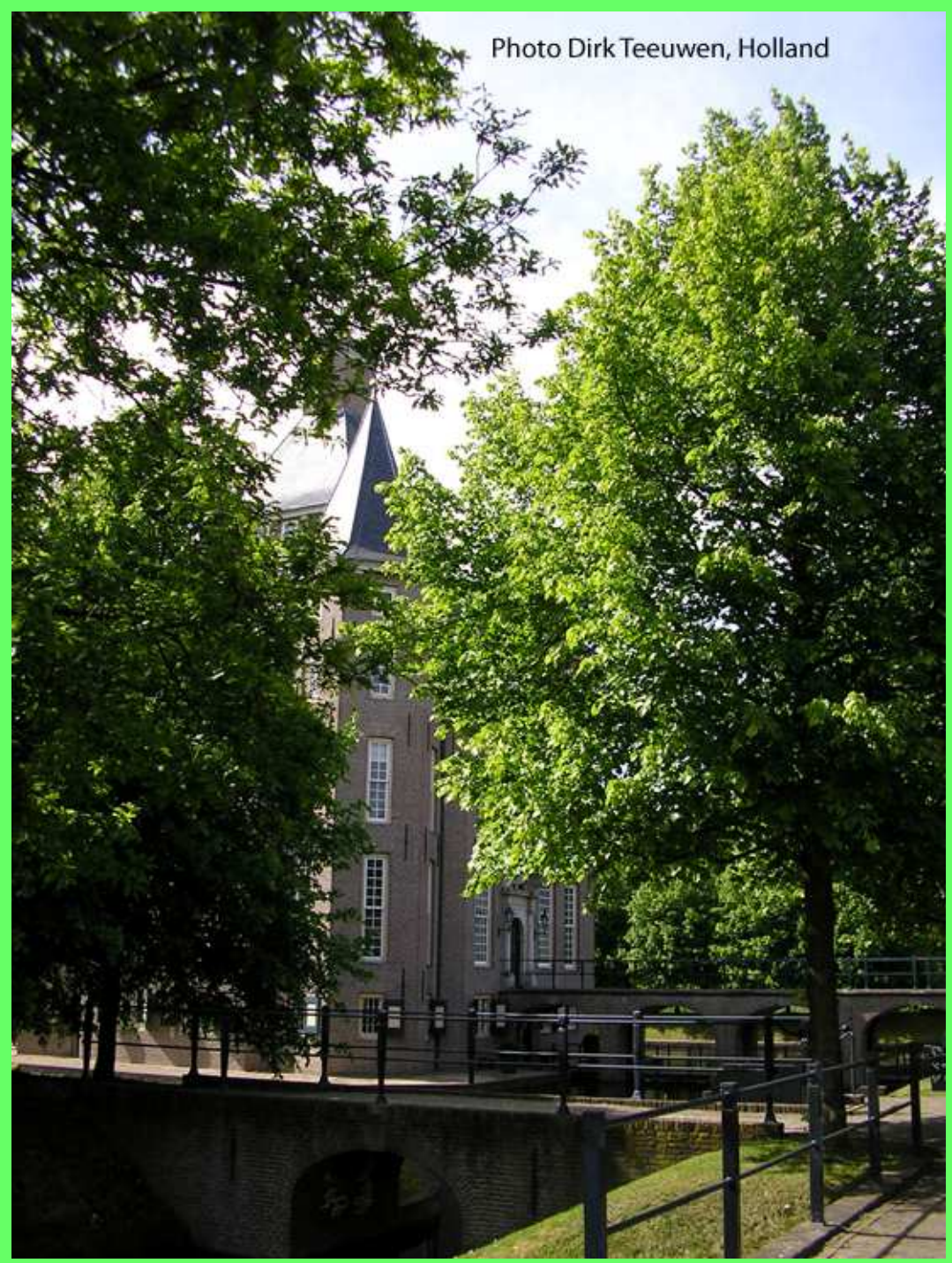
Heemstede Castle, 2015