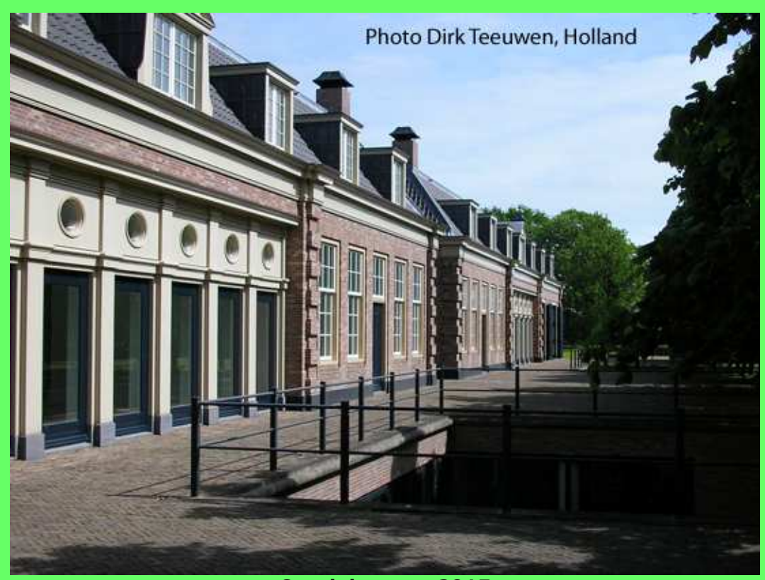
Coach houses, 2015