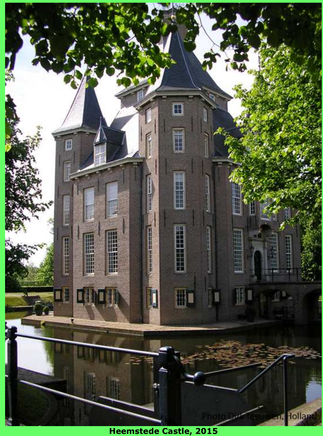
Dirk Teeuwen, Holland