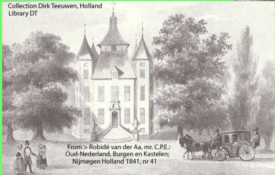
(New) Heemstede Castle, near the town of Houten, Province of Utrecht, Holland Circa 1830