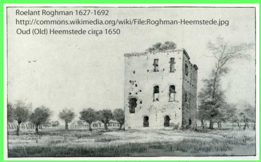
Ruïns, Castle "Old Heemstede" Circa 1650 Dirk Teeuwen, Holland Sources of text and pictures are clearly indicated in this article!