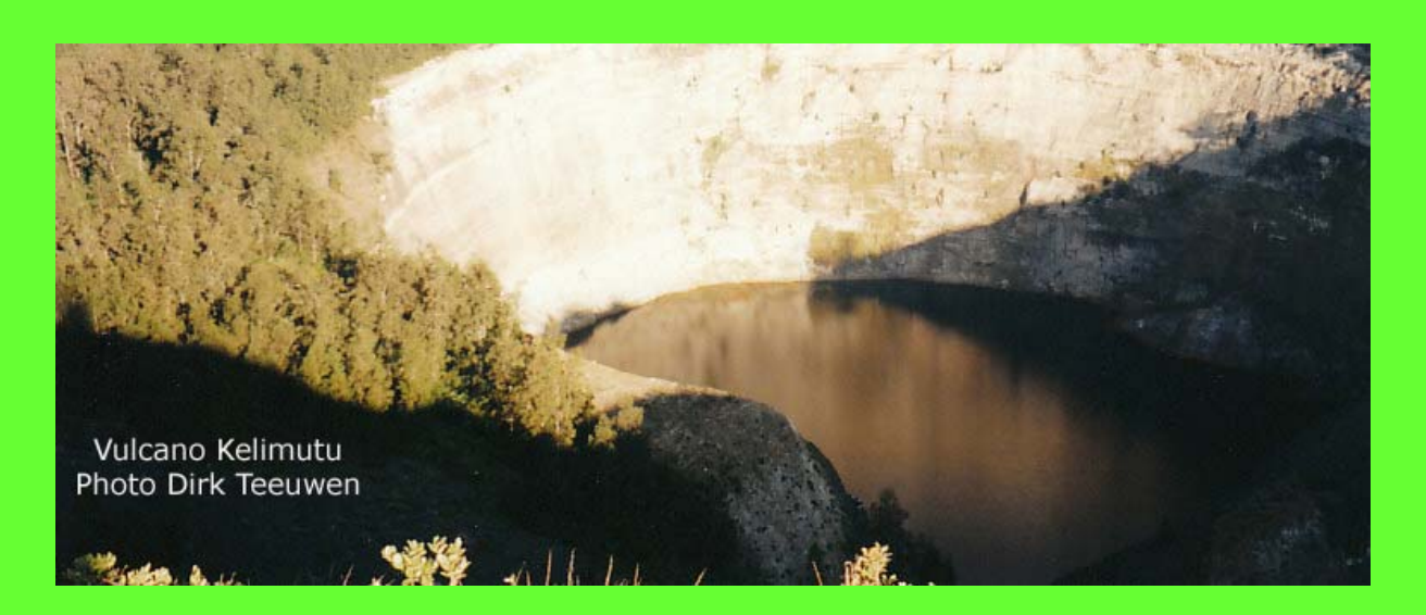
Vulcano Kelimutu, crater