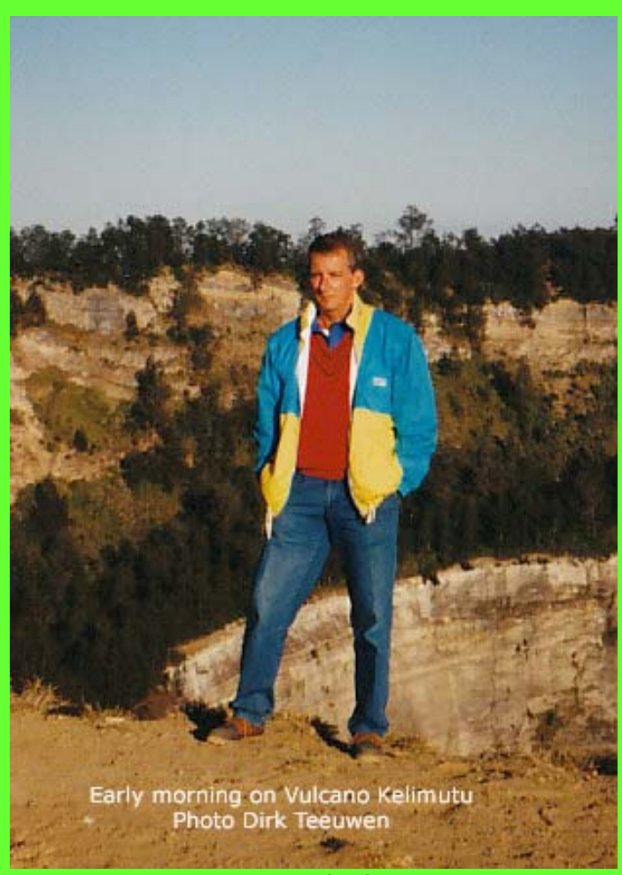
Me at 6 o'clock a.m.