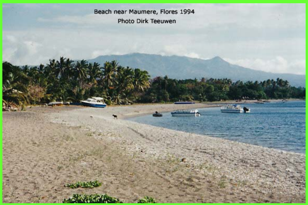
Beach near Maumere