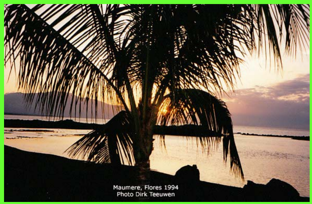
Evening dreams, Maumere