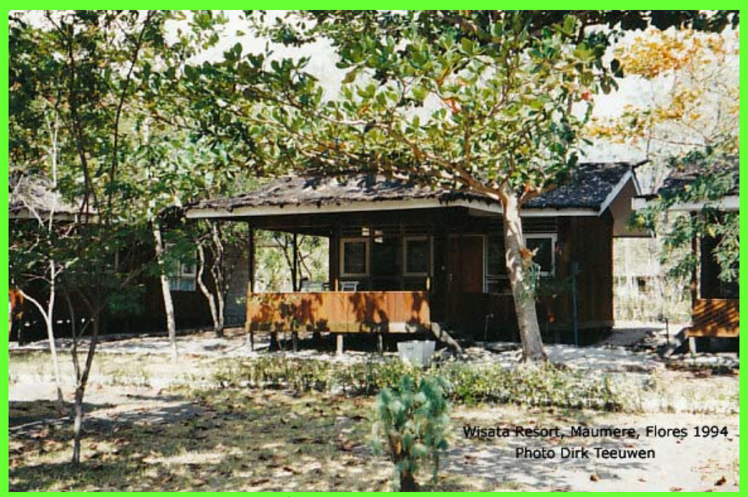
Tourist cottage, Maumere