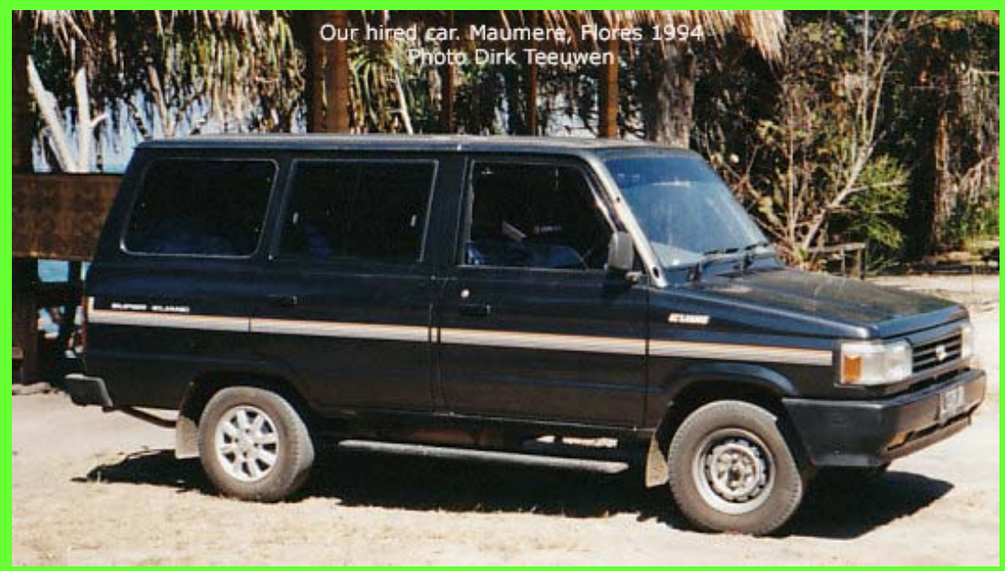
Nice car, bad roads, Flores 1994