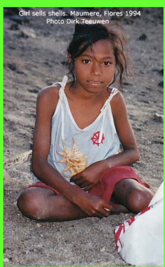
Little saleswoman, Maumere