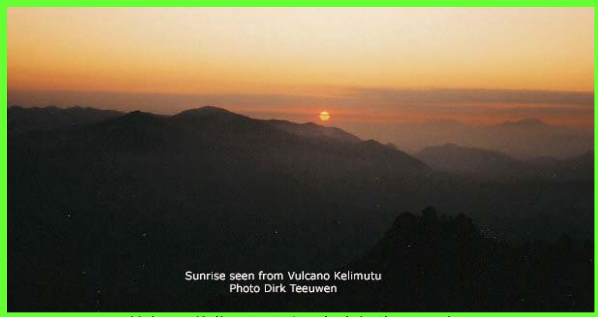
Vulcano Kelimutu at 4 o'clock in the morning