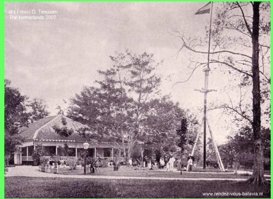
P.5 Residence of the Assistant-Resident of Sambas, West-Borneo 1929

Formerly the native rulers enjoyed the income of all sources, while from 1898 these revenues from taxes, concessions, industries, etc. flow into the treasury of the native state. The monarch received after 1898 an allowance and a reasonable share in the proceeds from concessions, etc. Expenditures for administration, education, waterworks, and so on, were defrayed out of the treasury.