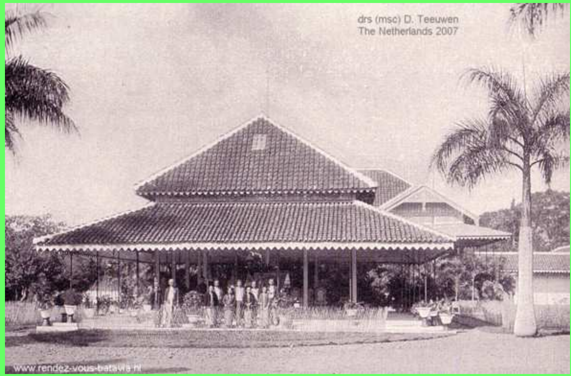
P.6 Residence of the Regent of Tjanjur / Tjiandjoer (Bogor), West-Java 1929