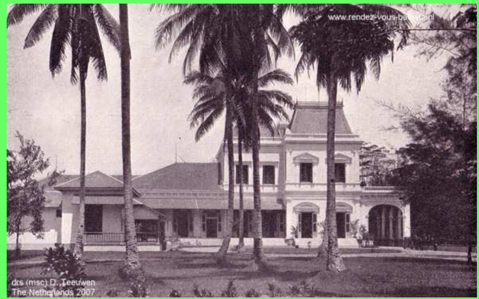
P.2 Villa of the Governor of Sumatra's East Coast, Medan 1912