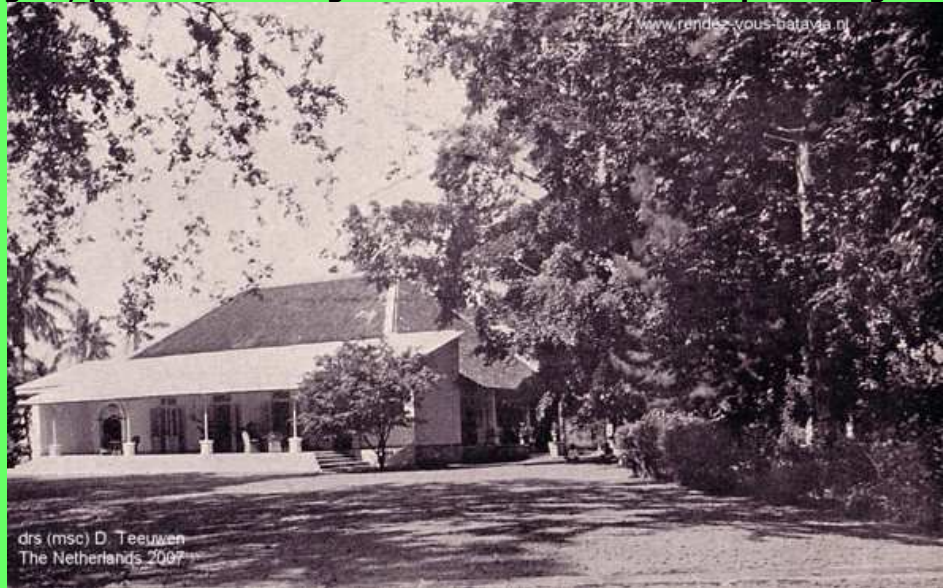
P.3 Residence of the Assistant-Resident of Bangil (Pasaruan), East-Java, 1929

The aim of the Government was to maintain the native states as far as possible and to develop them so that they were only incorporated in directly governed territories, when this was inevitable in the interests of the population. The Government exercised supervision through its officials. The relation of the Government to the rulers of the native states was until 1898 regulated by detailed treaties, which because of their details often made intervention difficult. Since 1898 most treaties have been substituted, whereby the monarchs had to carry out regulations and orders given by the Government. Mutual rights, powers and obligations were contained in special regulations.