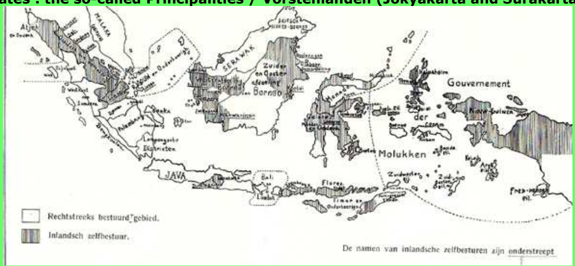
Dirk Teeuwen, 2015

The N. E. Indies were divided in directly governed territories and self-governing territories. These latter were ruled over by, more or less, independent native monarchs. The native states were of special importance on the Outer Islands. The Outer Islands were the N. E. Indian islands with exception of Java and Madura. On the Outer Islands lived 40% of the population within their self-governing territory. In Java was only 7% of the territory occupied by native states: the so-called Principalities / Vorstenlanden (Jokyakarta and Surakarta).