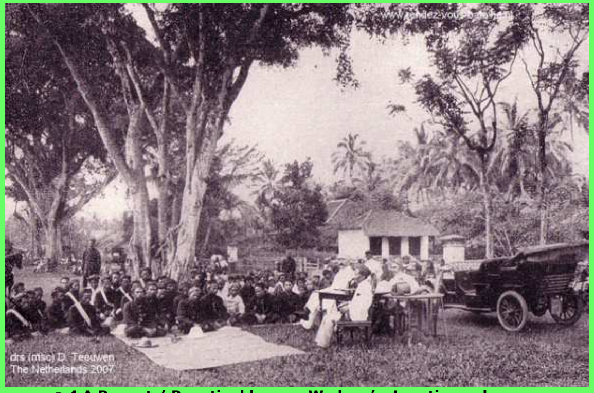
P.4 A Regent / Bupati addresses Wedana's. Location unknown.