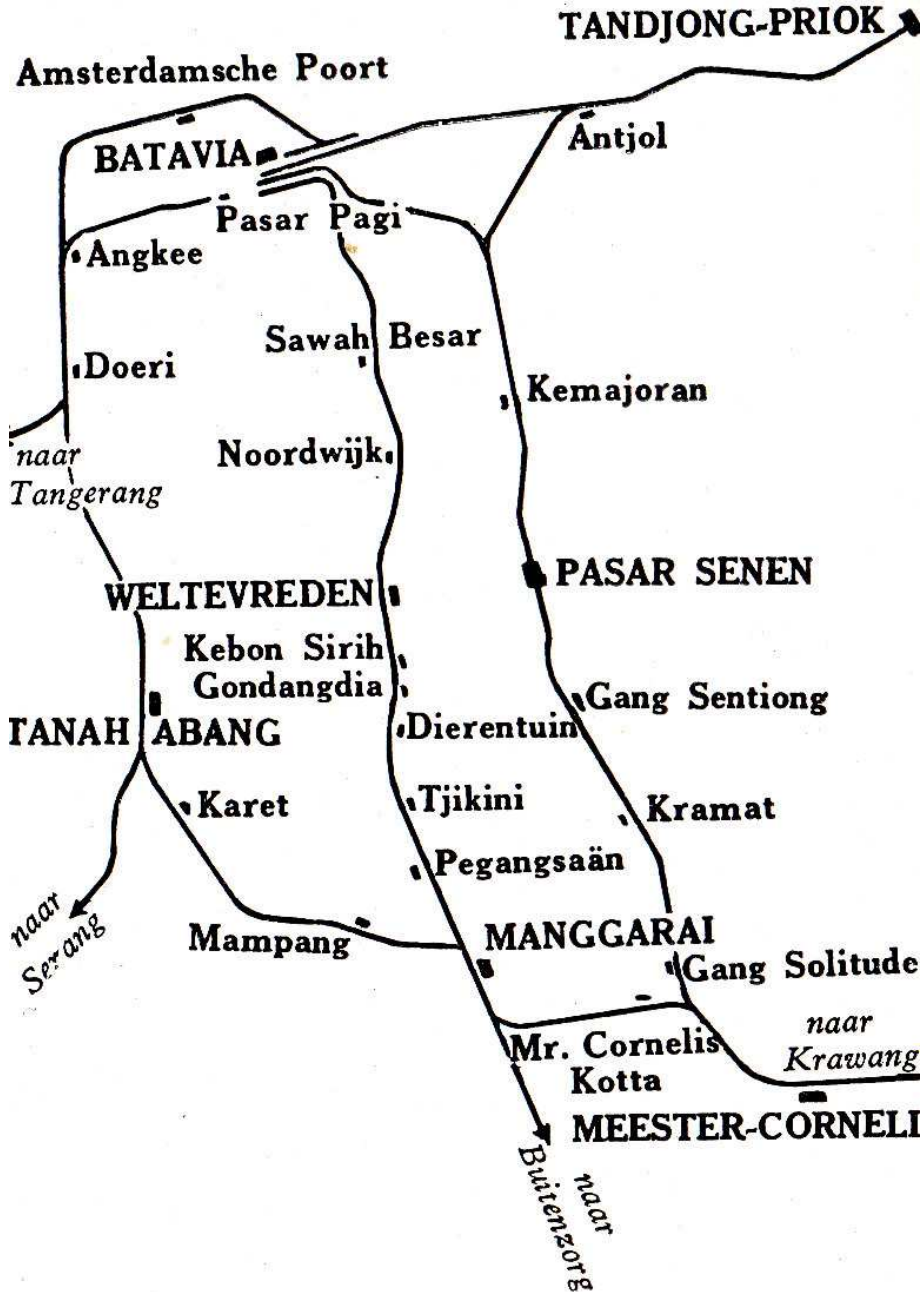
7. Batavia, railway lines, 1937

Between 1952 and 1962 the exploitation of the Batavia / Jakarta tramways came to an end, caused by financial losses. One of the many examples of the energy with which the Dutch colonial authorities from 1880 until 1942 tried to solve lags in economic and social development - in this case the stimulation of public transportation in Batavia / Jakarta - was from 1962 only a memory.