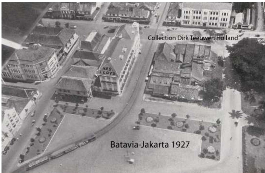
8. Steam-tram on Stadhuisplein / Taman Fatahilah The old building next to the Ned-Lloyd office is Café Batavia nowadays. Old Batavia / Jakarta Kota 1927