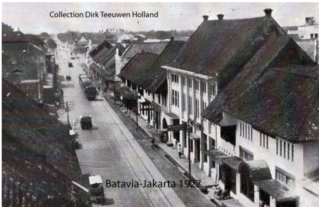
4. Steam-tram, Binnen Nieuwpoortstraat / Jl Pintu Besar Utara Oud Batavia / Jakarta Kota 1927