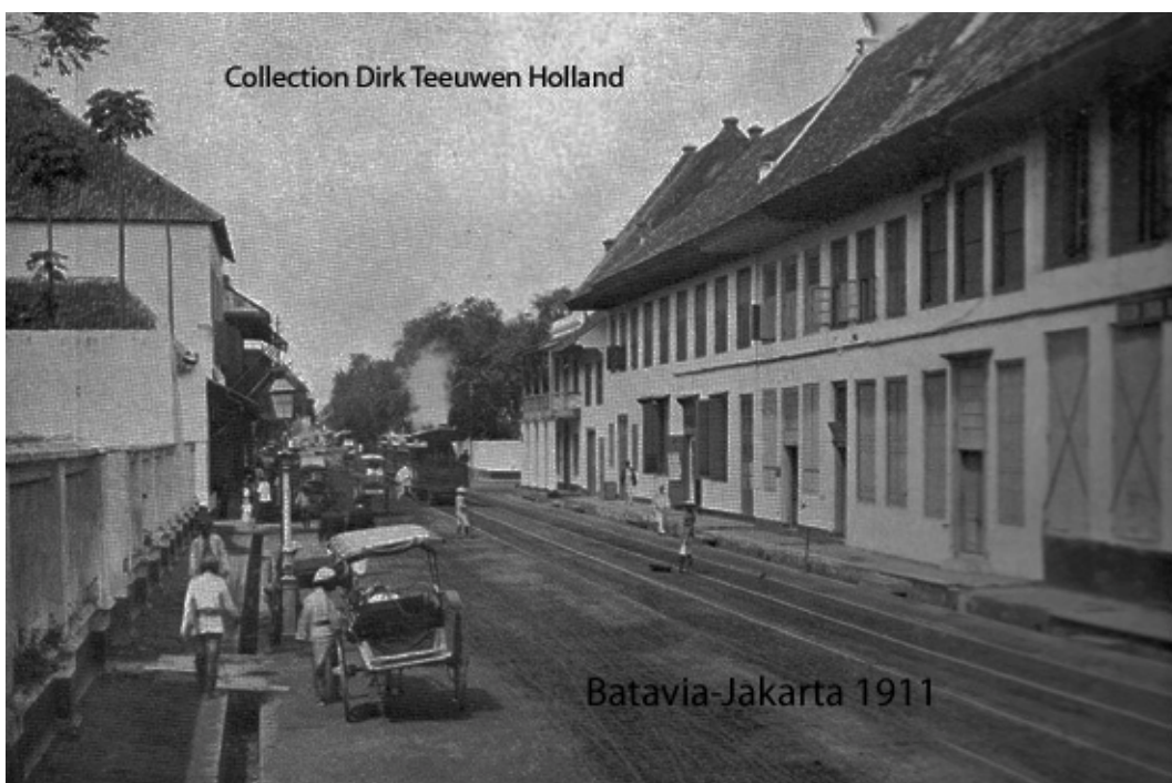
5. Steam-tram heading north, Binnen Nieuwpoortstraat / Jl Pintu Besar Utara near Stadhuisplein / Taman Fatahilah Oud Batavia / Jakarta Kota 1911