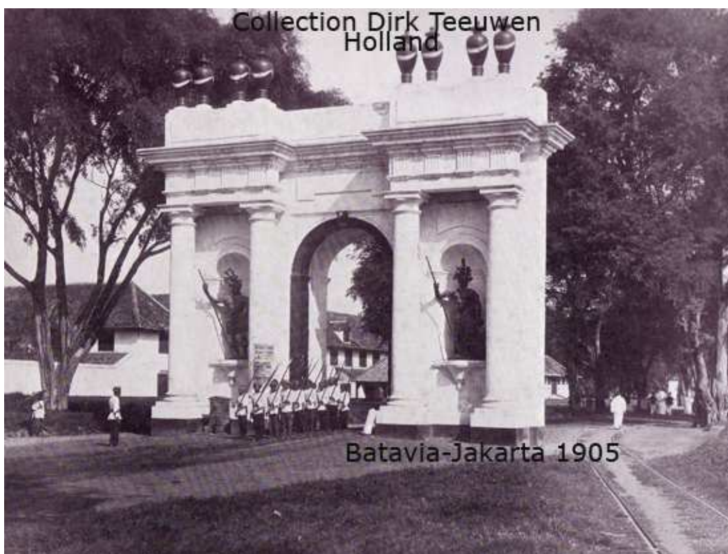
18. The Amsterdam Gate, Batavia / Jakarta 1905 Tramway rail is visible at right.