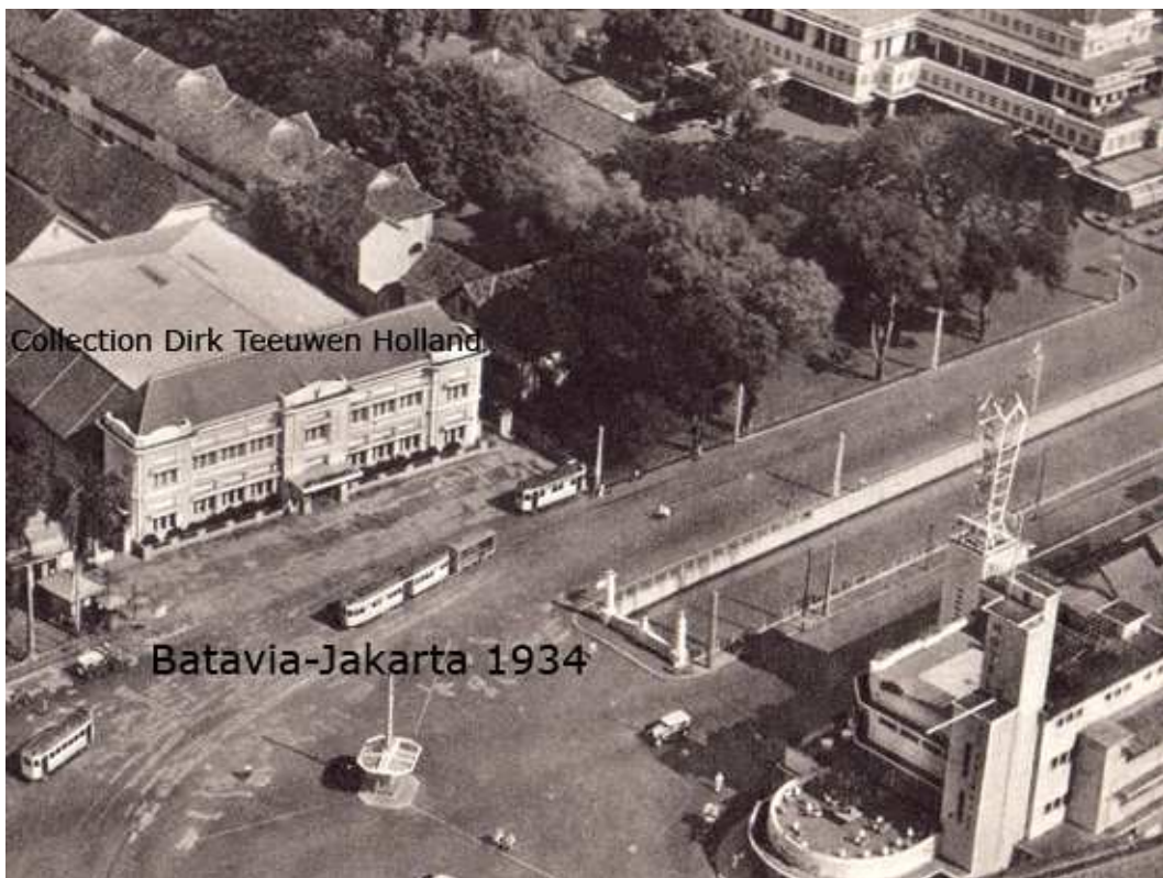
13. Important transfer location on the northern end of Molenvliet West / Jl Gajah Mada (southern end), Batavia / Jakarta 1934 Top right one can see a part of the Hotel Des Indes.