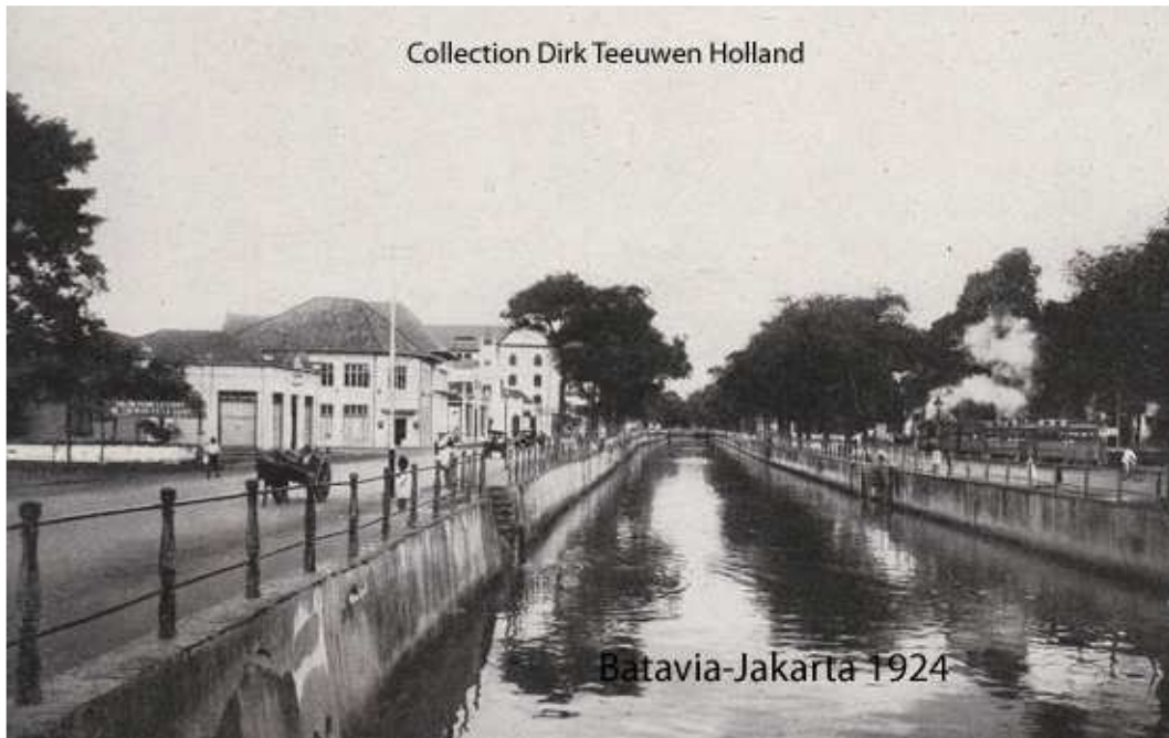
9. Steam-tram (see at the right side of this picture the plume of smoke) on Rijswijk / JI Veteran Batavia / Jakarta 1924