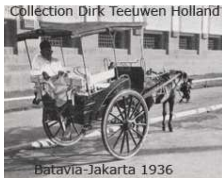
12. Watch this man: dozing, maybe sleeping. Ostensibly! His proper wakefulness meant a cutthroat competition with the tramway companies. His horse - in heat and sun - suffers from dehydration: so far as I can see.