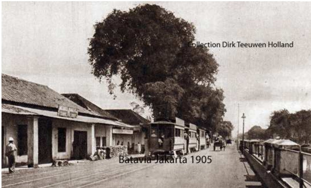
6. Steam-tram, Molenvliet West / Jl Gajah Mada Batavia / Jakarta 1905

The total length of the lines was 40 km divided over 6 lines. The main line, nr 1, from Old Batavia / Jakarta Kota to Meester Cornelis / Mester, had a length of 14 km.