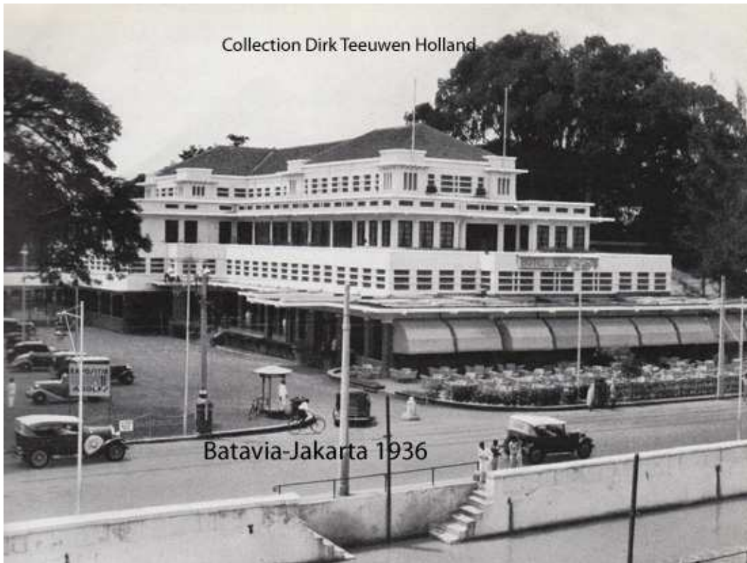
14. Hotel Des Indes, Molenvliet West / Jl Gajah Mada Batavia / Jakarta 1936