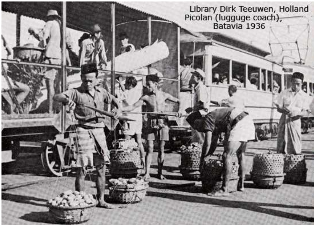
Holland Picolan (luggage coach), Batavia 1936