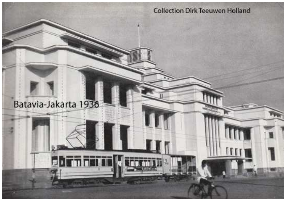
11. Stationsplein / Taman Stasiun Kota^ Electric tram in front of Bank Impor-Expor, formerly the Nederlandsche Handelmaatschappij NHM. Mark this pikolan (luggage coach, see text). Old Batavia / Jakarta Kota 1936