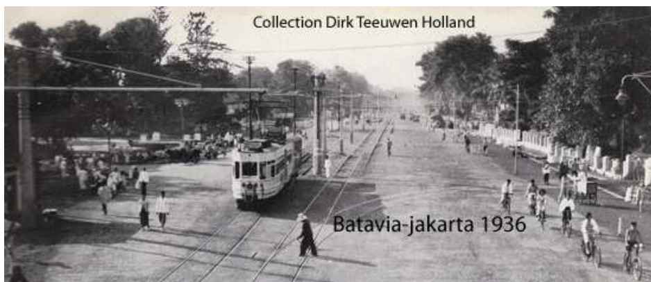
10. Electric tramway, Kramat Batavia / Jakarta 1936