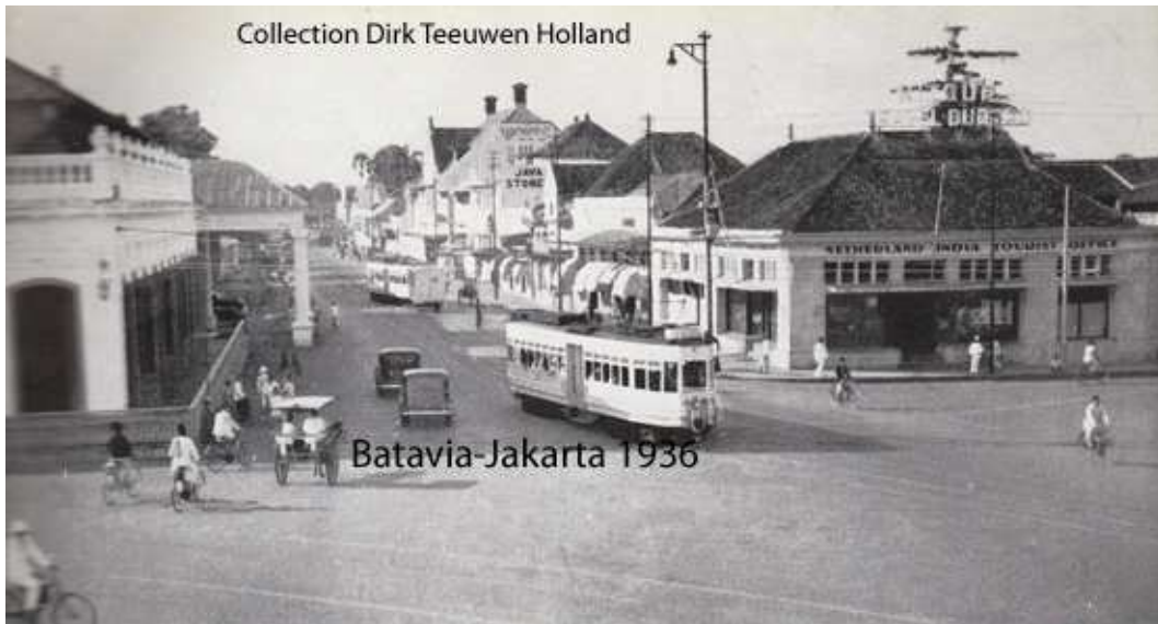
12. Tram driving into Rijswijkse Straat / Jl Majapahit, colonial shopping street nr 1 Harmoni, Batavia / Jakarta 1936