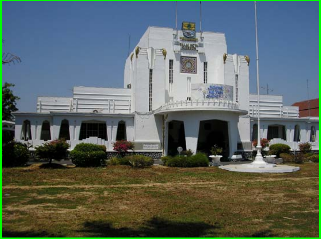
8. Dutch colonial heritage: City Hall, Cirebon; Java 2006